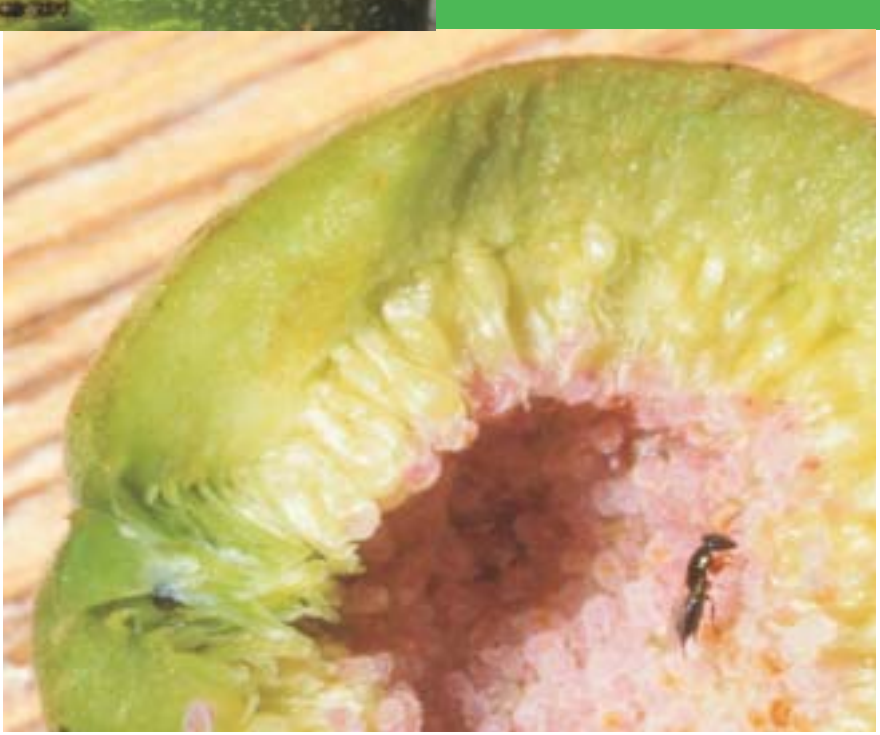
TOP: Females of the non-pollinating fig wasp, Apocrypta guineensis , laying eggs through the fig wall of Ficus sur . ABOVE LEFT: Three non-pollinating fig wasps. Philocaenus (top) enters the fig to lay eggs, Sycoryctes (centre) has a long ovipositor for laying eggs through the fig wall, and Otitesella (below) also lays eggs through the fig wall, but the ovipositor is concealed within the body. ABOVE RIGHT: Philocaenus rotundus (a non-pollinating fig wasp that enters the fig) laying eggs inside a receptive Ficus abutilifolia fig that has been split open. Photos and illustrations: Simon van Noort.

species. Fig size varies tremendously across species, from smaller than a marble to as large as a tennis ball.