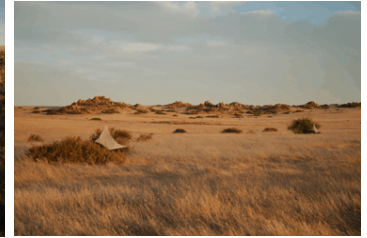
Malaise trap in Shale Renosterveld (left and top right); malaise trap in Roggeveld Dolerite Renosterveld (bottom right)