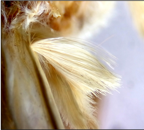
Figure 3 – Basal hair brush on basal posterior margin of Phassodes vitiensis (Bishop Museum).