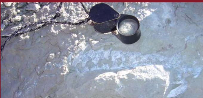
Skull of the curled-up Thrinaxodon skeleton Roger Smith brought back from Antarctica in 2003.