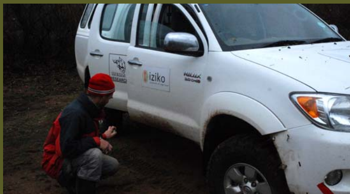
The Iziko vehicle bears the scars - having covered more than 6000 km, often on hazardous off-road 4x4 tracks - of accessing fig trees in isolated areas.