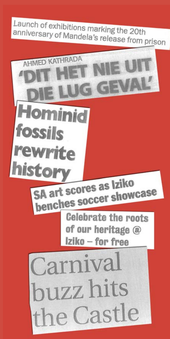
Iziko in the news in 2010.