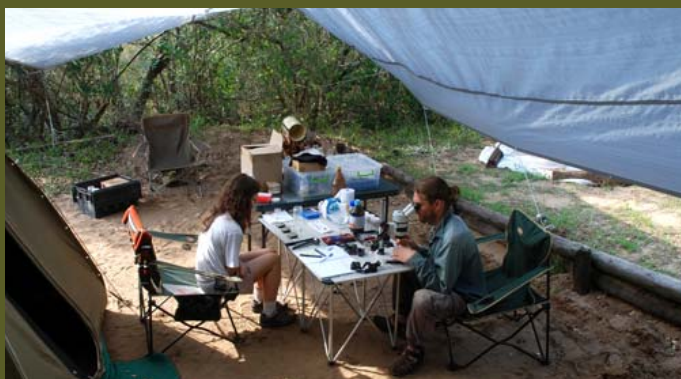
The portable field laboratory set up as an open campsite at Mabibi. The scientists endured almost a month of working 24/7, through weekends and into the night.