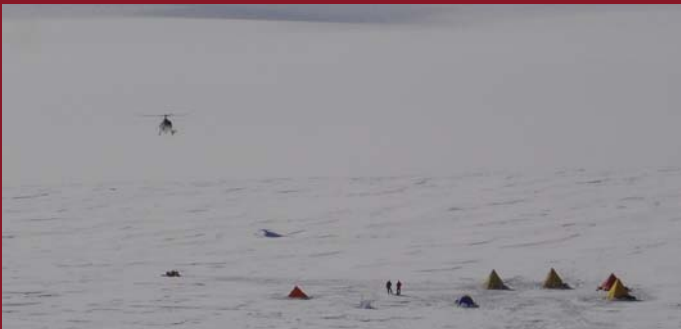
A helicopter comes in to land at the remote camp on Beardmore Glacier.