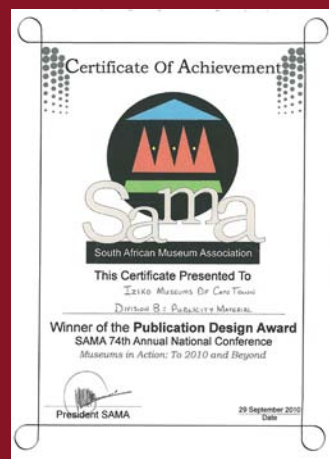
The SAMA Publication Design Award, received for publicity material produced for the Not Alone campaign.