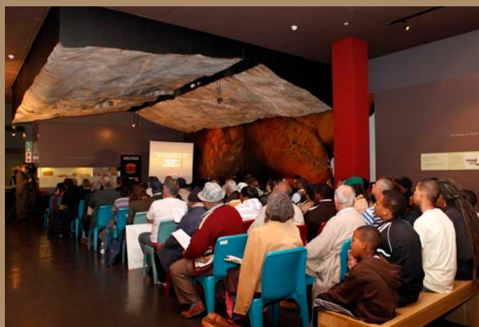
A diverse audience of young and old attended the symposium, held in the Rock Art Gallery at the Iziko South African Museum.