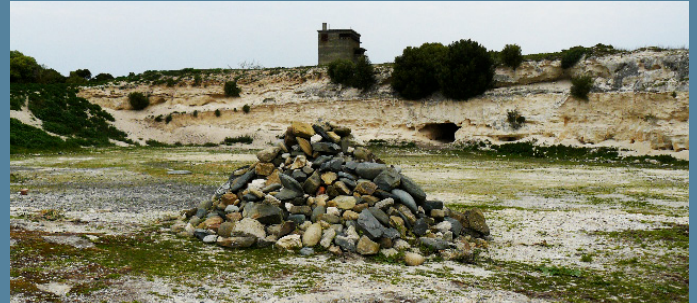
The Limestone quarry at dusk, with the famous cairn in the foreground

The much-anticipated overnight visit and hike on Robben Island began on a glorious Friday, with a smooth crossing to the island, but ended with a hasty evacuation at 7:30 the next morning when the weather started deteriorating rapidly. The return crossing was in considerable contrast to the previous day, with wind and unpleasant swells. An attempt to complete this geological experience had to be aborted due to the weather, and the trip has been postponed until a suitable time can be arranged - depending on the weather yet again!